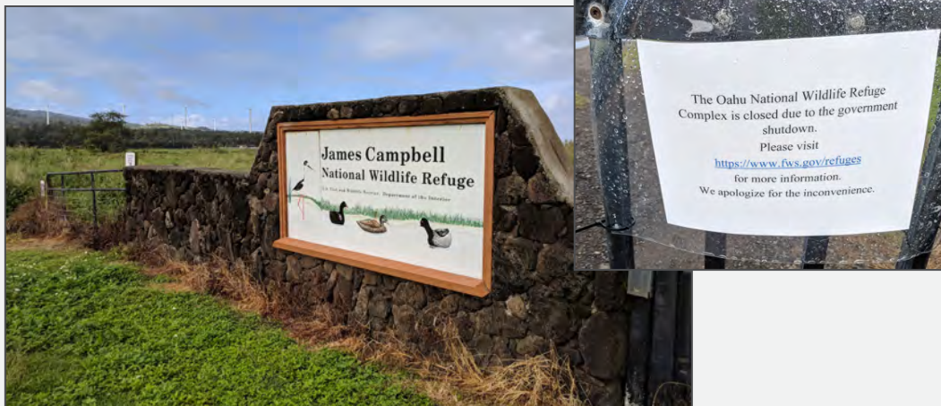
Guided tours were cancelled at James Campbell NWR.

Volunteers visiting the James Campbell National Wildlife Refuge in January on O'ahu, Hawaii were disappointed to learn they would not be able to go on their planned tour because of the shutdown.